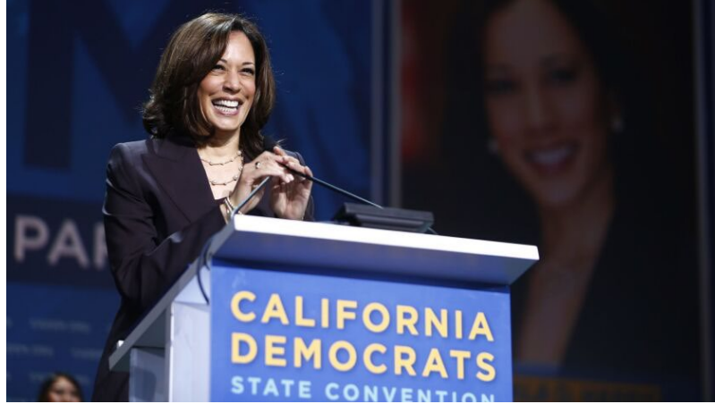
Credit: California’s most famous Democrat Kamal Harris - Los Angeles Times.

From California Madness comes many reports for this chapter regarding the ideological failure of California falling squarely on the shoulders of progressive politicians and activists, social justice reformers, civil rights workers, cultural appropriation enforcers, diversity, and inclusion warriors and the like who have spread into the media, government, college campuses, neighborhood organizations and workplaces.